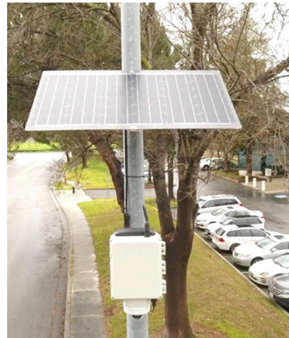
V5 Portable Security Unit

The Portable Security Unit allows you to take a full security system and install it to video surveillance and gunshot detection in an area of interest. Chemical detection sensors will be included in the near future. Any Dell partner or Independent Software Vendor (ISV) with specific IP and features can customize the Self-Powered Portable Edge Computing unit (PECU) it for specific end applications and work with Arrow Electronics to integrate their validated 3rd party software or sensors.