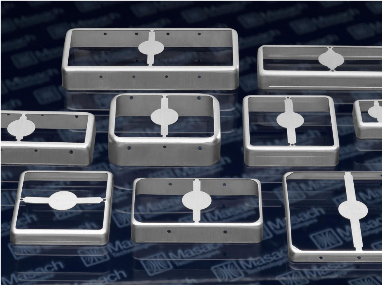
Masach wide range of Standard Drawn EMI/RFI Shields

In a fast-paced industry, where custom design products are losing their relevance, standard solutions are required.