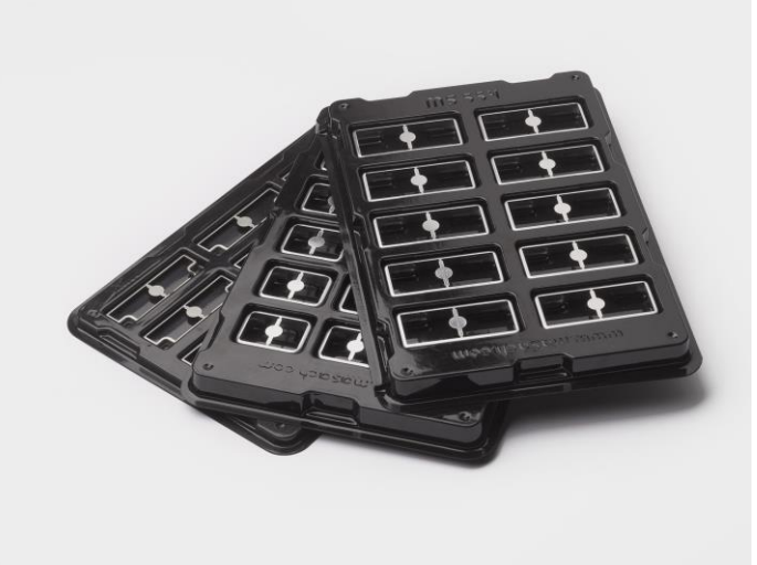
Masach Seamless Protective Cage, Two-piece Drawn EMI/RFI Shield