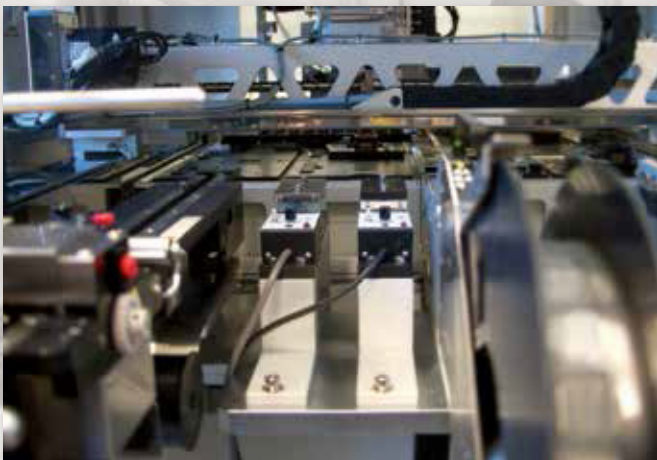
Our programming centres feature state of the art equipment.

At our Global Programming Centres, we have established rigorous processes that ensure your order is completed to your satisfaction anywhere in the world. Our sophisticated redundant systems and state-of-the-art equipment ensure reliability, time after time.