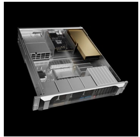
Figure 3. NVIDIA-Certified Systems bring powerful speedups to AI training and inference.

NVIDIA Fleet Command™ is a managed platform for container orchestration that streamlines provisioning and deployment of systems and AI applications at the edge. It simplifies the management of distributed computing environments with the enterprise scale and resiliency of software as a service, turning every site into a secure, intelligent location. Layered security protocols managed by NVIDIA protect intellectual property and application insights as well as automatically identify and defend against threats. Fleet Command leverages a robust set of AI tools and a catalog of ready-to-deploy partner applications to create a secure, end-to-end platform for edge AI that's capable of operating in any environment. Fleet Command provides turnkey AI orchestration that keeps organizations from having to build, maintain, and secure edge AI deployments from the ground up.