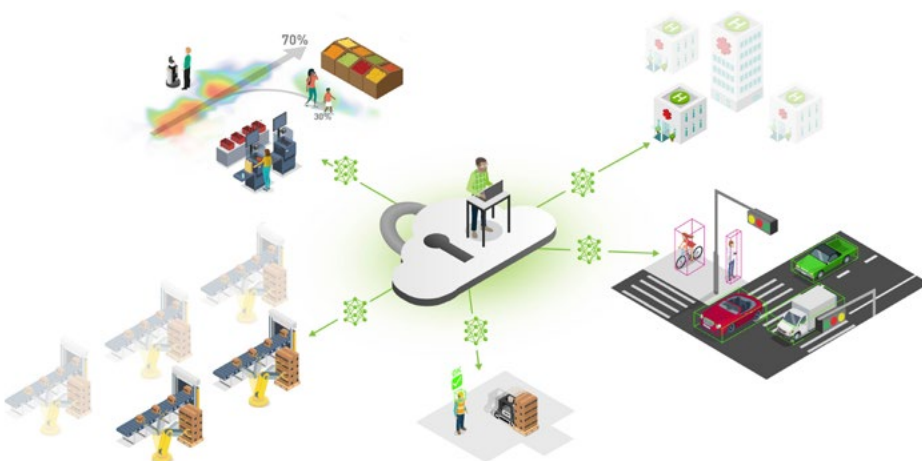
Figure 2. NVIDIA Fleet Command offers a simple, managed platform that makes it easy to provision and deploy AI applications and systems at thousands of distributed environments, all from a single cloud-based console